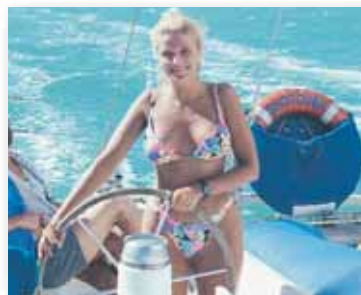
The Master's Apprentice

You'll hear the dolphins' often funny and always incredible, vocabulary through our underwater microphone. Amazingly, the crew can tell you what the sounds mean.