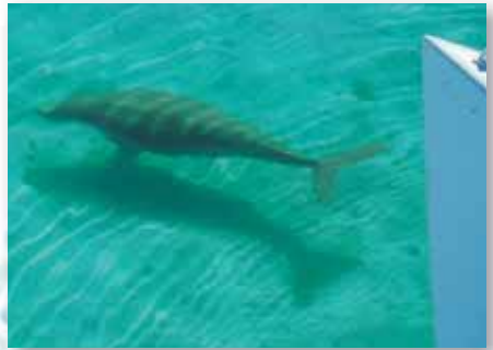
Dugong in crystal shallows.

Plus, Quality Assurance Accreditation from the Australian Tourism Accreditation Authority ✓