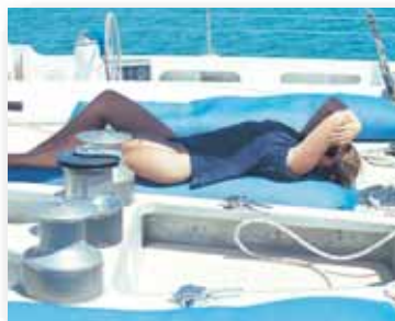
Lay back and really relax