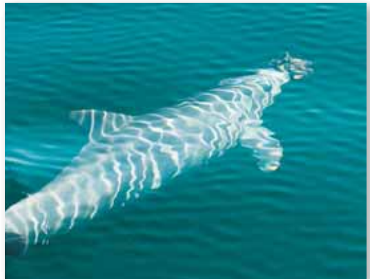
"Sponge Mum" The only dolphins to use tools.