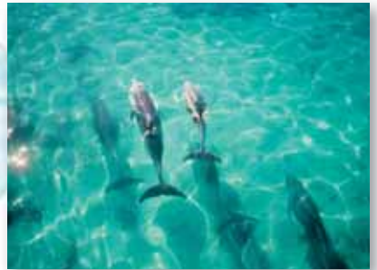
Dolphins lead the way.