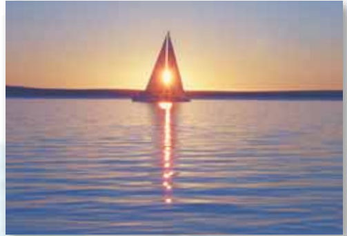
Shotover at sunset.