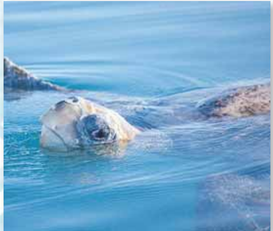
Old Man Loggerhead Turtle.